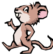
Figure out your carbon footprint. The link is found on our website www.whumc.org , click what's new button and then the survey page link.